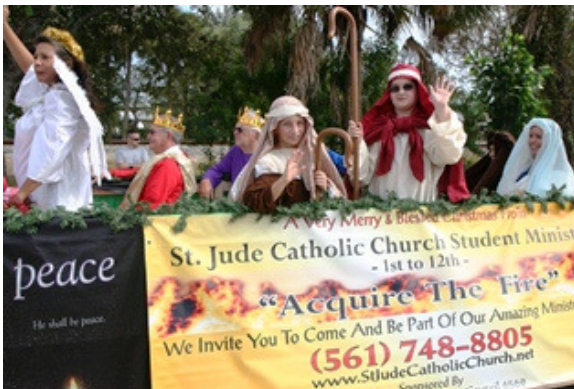
Brothers portraying the three wise men catch a ride in the JTAA parade.

see the rest of the pictures at facebook.com/kofc6569