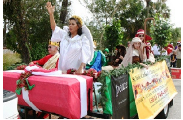
Brothers portraying the three wise men catch a ride in the JTAA parade.